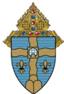
Diocese of Joliet

If you do not receive a CMAA mailing, please contact the parish office. Thank you!